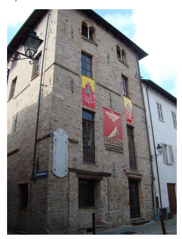
Figure 14: Ecomuseo dei Terrazzamenti e della Vite, headquarters

Ecomuseo dei Terrazzamenti e della Vite is located in Cortemilia, in the Cuneo province of Piemonte. Through generations of work and ingenuity the natural rolling hills and valleys have been transformed into a beautiful terraced landscape. The ecomuseum focuses on the terraces as a theme for interpretation, community engagement and regeneration. Three main sites are incorporated into the ecomuseum landscape, which serve as unique meeting points for community. The first is the centre of documentation and interpretation located in the town center. This building acts as an interpretation centre, a children's library, and staff offices, meeting areas, classrooms and digitization center. The building and surroundings has been restored making the outdoor square a pedestrian only zone and expanding the museum outdoors where community exhibits are held.