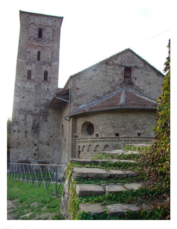
Figure 18: Monteoliveto Church

A Roman era church at the foot of Monteoliveto provides a good example of continuity. The stone structure shows many signs of alteration through the centuries. Its masonry shows evidence of different hands, techniques; with expansions as well as possible deconstructions of extra space. Certain artifacts incorporated into the churches décor appear to have been imported from another location, making for a collage of the centuries.