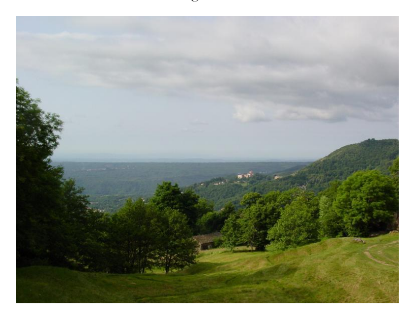
Figure 1: Serra Moriane Landscape

Ecomuseo Valle Elvo e Serra is located in the western part of the Biella province in Piemonte. Geographically, the Serra Moraine and the Elvo torrent valley define its territory. It territory is closely linked with Ecomuseo Anfiteatro, also include in this report. This rich landscape is the central theme of ecomuseum projects as it works to build new relationships between people, record the memories and experience of living in the area, and look towards the future with conservation and asset management.