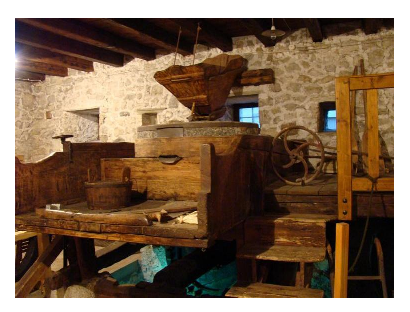
Figure 9: Stone mill in ecomuseum headquarters