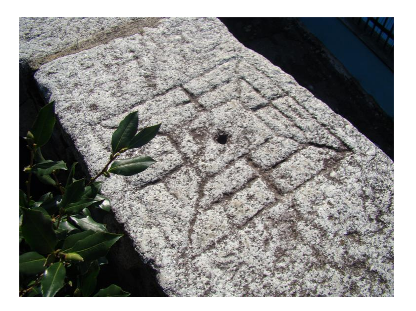
Figure 22: Nine Men's Morris