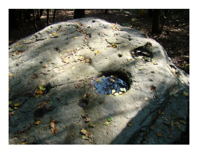
Figure 21: Celtic period stone. The interconnecting potholes and channels are on a slooping panel. When the upper depressions are filled with enough liquid the entire panel is covered. The rock appears to have been partially destroyed at some point in history

Rock art is located in many places on the landscape territory. Some have associated legends and stories while others remain a complete mystery. Some of the rock panels date to the Celtic period before the arrival of the Romans and some of these have been modified or destroyed in later periods. This damage is suspected to be a result of the inquisition when places used in pagan ceremonies were "exorcized" to stop their use. Evidence for this is found in historical documentation that is linked to a few specific rock art sites.