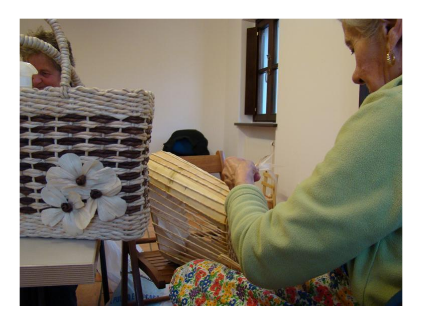
Figura 12: Corn Husk Weaving Workshop (finished corn husk bag)

Pan di Sorc is an ongoing project that uses "traditional knowledge" in modern flavors. This is a network of restaurants, farmers, and craftspeople that connect the past to the future through the use of traditional knowledge and products. The project grew from a focus around a type of maize bread, once common in the region but almost forgotten. Archaeologically this project relates to the hands-on traditions where one can link to the past through practice. For example a type of weaving and craft with corn husks has a history in the region of at least 400 years but was almost a lost tradition. Workshops sharing this knowledge have given community members a chance to learn to make bags, dolls, ornaments and even seats for chairs.