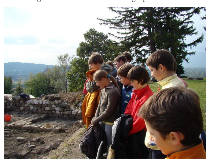
Figure 11: School class viewing Artegna San Martino site before they start their own excavation work

Since April 2009 the ecomuseum and Artegna Culture Division have been working on connecting school children with their archaeological heritage. This allows children to get their hands dirty at the archaeological excavations where they learn to excavate, screen and clean objects. In October 2009, professional excavations were underway and the children were able to see archaeologists at work before excavating a piece of the site themselves.