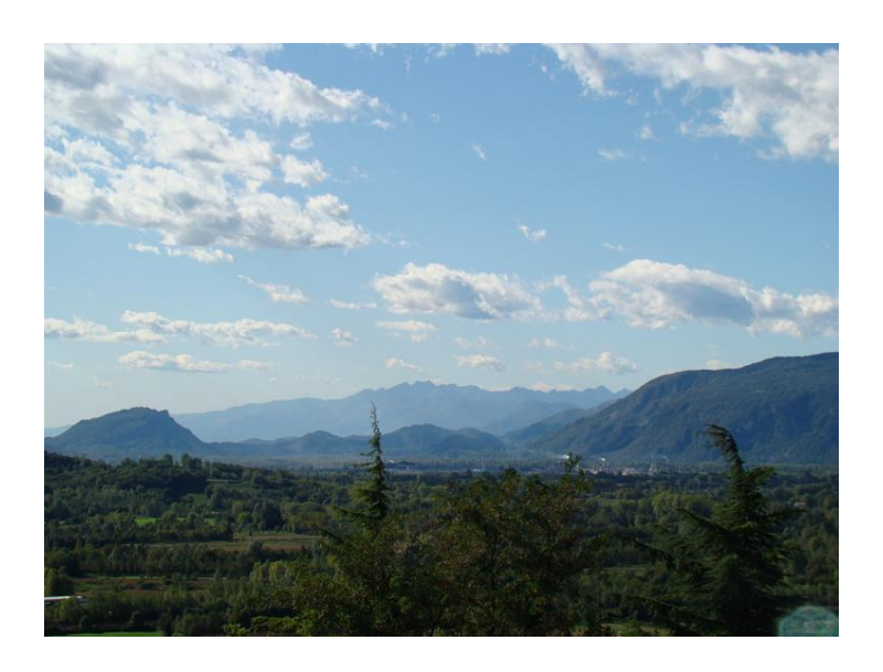
Figure 7: The alluvial plain and prealpine hills

Ecomuseo delle Acque is located in the province of Udine in the Friuli Venezia Giulia region. Its territory is a homogenous ecological zone described as an alluvial plain bordered by prealpine mountains and hills. As illustrated in the ecomuseum's name, water is used as the central theme to show local distinctiveness. The rivers, mills, fountains and old public washbasins are all key sites and focal points for continuity, interpretation and community organization. For example, the ecomuseum headquarters is situated inside of a restored mill where visitors can see the importance of water for both power and sustenance.