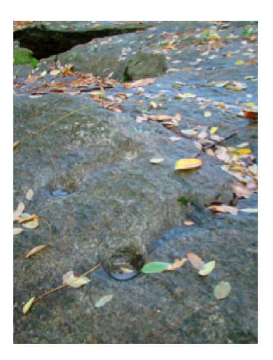
Figure 4: Celtic rock carvings at la Bessa