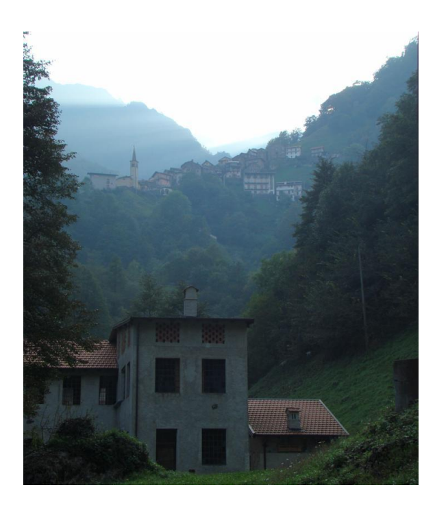
Figure 23: Ecomuseo della Valstrona (a restored wood mill)