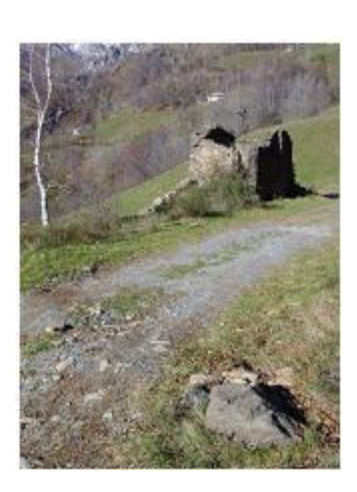
(Picture of the engraved rock and the pre-existing building Il masso inciso e la costruzione preesistente)

Effettuati gli opportuni rilievi e in accordo con gli archeologi del Museo del Territorio Biellese e con la Soprintendenza per i Beni Archeologici del Piemonte, nel novembre 2004 il masso è stato rimosso e ricoverato all'interno della Trappa, nella prospettiva di un progetto di valorizzazione che individui una serie di percorsi e relazioni tra i luoghi d'origine e i luoghi di studio e conservazione dei reperti archeologici.