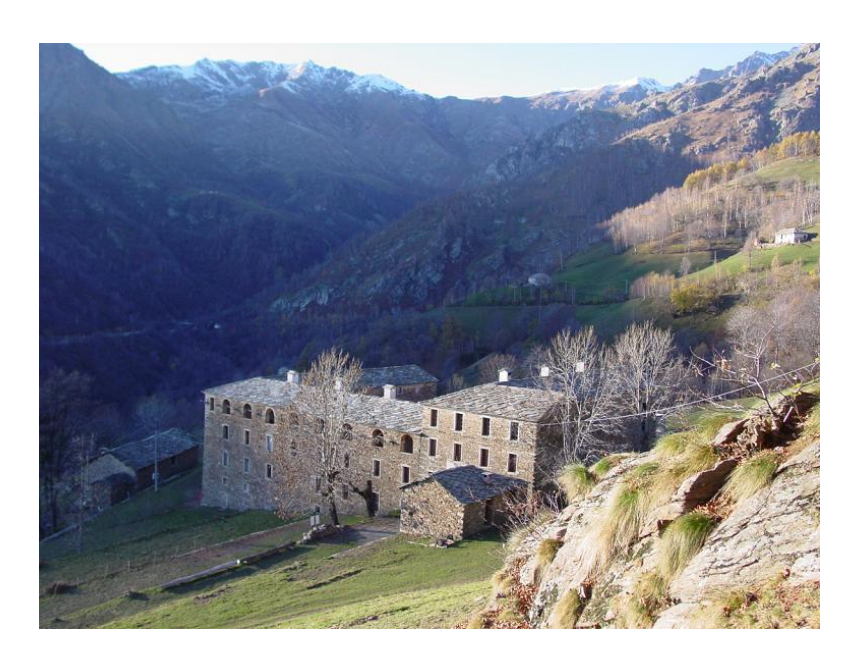
Figure 2: La Trappa

Another example of the living museum is la Bessa. This gold mining site from the 1st century BC, is not only a record of Roman exploitation of the area but the host for the Gold Mining World Championships which brings miners from around the world to compete and exchange cultural knowledge.