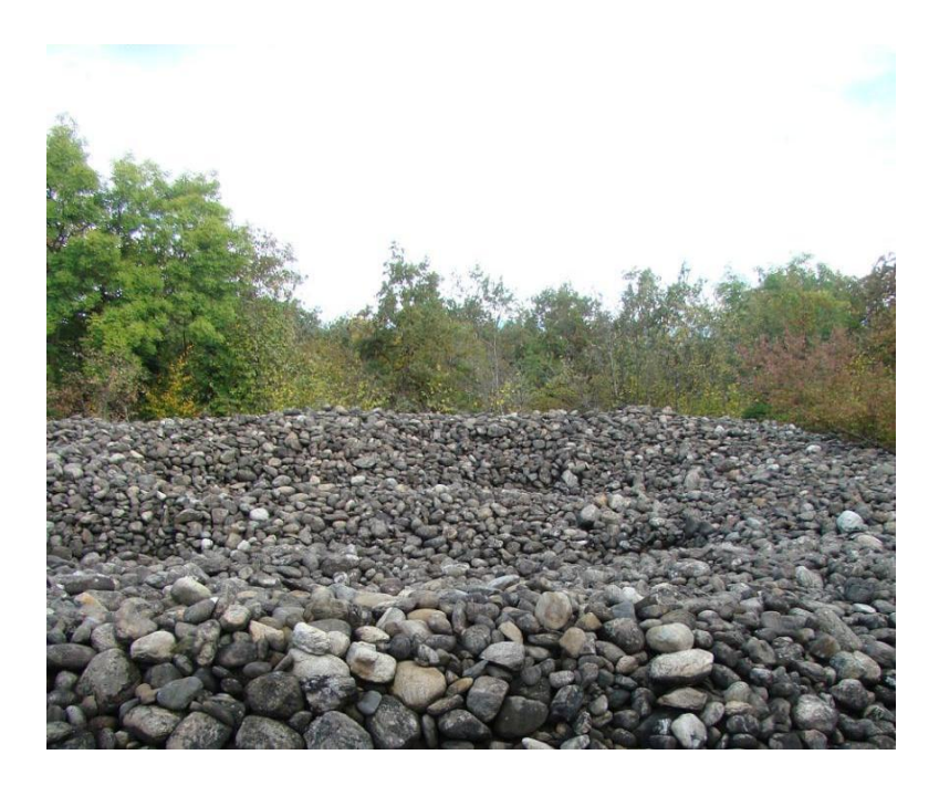
Figure 5: La Bessa, Roman Period structural remains