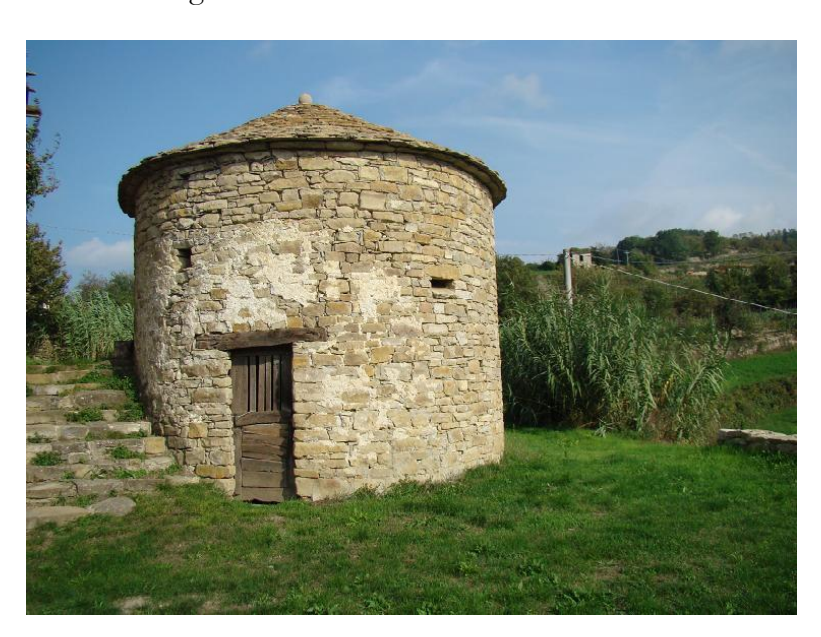
Figure 16: "Scau" Chestnut Drying Structure

Lastly the 'Scau', chestnut drying hut, is a restored structure that has been put into action with a yearly drying (occurring over a period of 40 days). The building is also used as a community meeting place for regular meetings or story telling. All three points on the landscape are connected through trails.