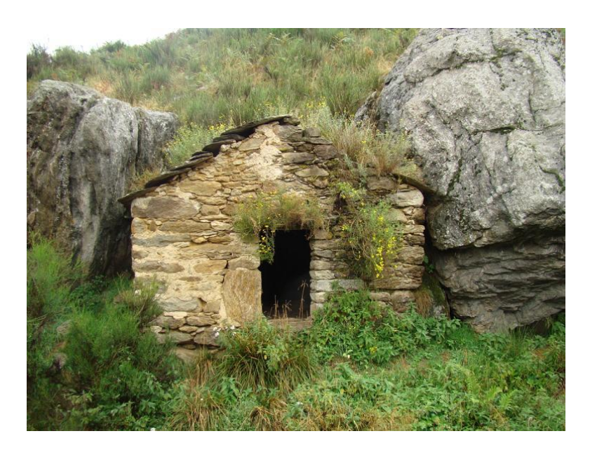
Figure 6: Stone structure (once a storage for cheese, now no more in use)

The Serra Moraine hosts an interesting historical legacy in a series of farmsteads, stonewalls and enclosures. Construction methods of these features include mortar and dry stone techniques, and often utilize natural rock formations on the landscape. These had/have varied purposes as houses, barns, temporary shelters, storage sheds and animal pens. Many structures have been visibly altered through time and some are still used today showing a continuity of over 400 years.