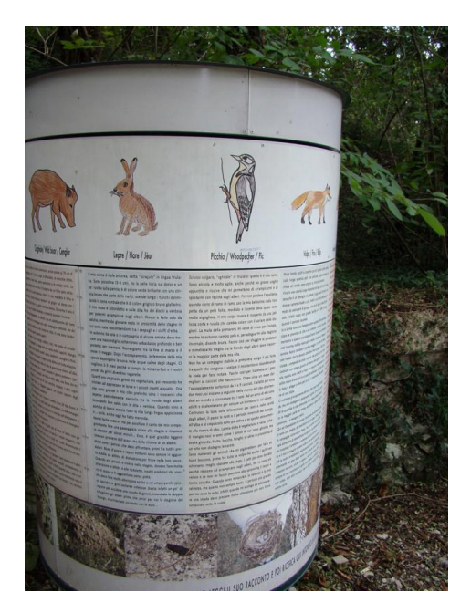
Figure 10: Ecomuseum Plaque about the animals created entirely by Class 4 children. Each section rotates to match up text, picure and animal trace