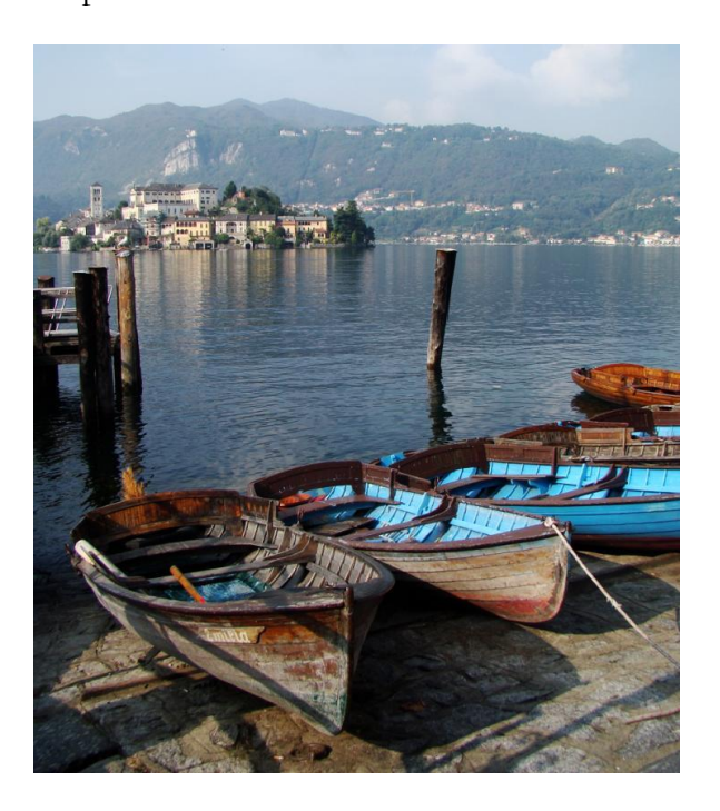
Figure 19: Lago d'Orta

Ecomuseo del Lago d'Orta e Mottarone is locate in the Verbano Cusio Ossola Province of Piemonte and has its headquarters in village Pettenasco. The territory incorporates three geographic areas: Orta Lake, Valstrona Valley and Mount Mottarone. Continuity is a key theme, connecting the past to the modern life and future of the area. The ecomuseum incorporates a network of small museums, laboratories, botanical gardens and trails. Each site tells a part of the diverse history and culture by focusing on a specific local tradition, trade, art or the relationship of humans to the natural environment.