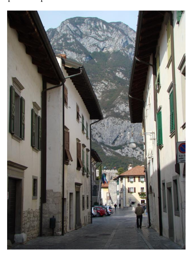
Figure 8: Venzone Main Street (reconstruction versus original constructions can be observed in patterns of the plaster)

The city of Venzone is a good example of a middle aged city, although it has been almost entirely rebuilt. It was declared a world heritage site a few years before the 1976 earthquake, which produced detailed documents of the cities architecture and infrastructure. In the rebuilding of the city each brick was placed in the same place but the reconstruction used allows people to see how much was destroyed in the earthquake, using various techniques in the building methods like paint or plaster or bricks.