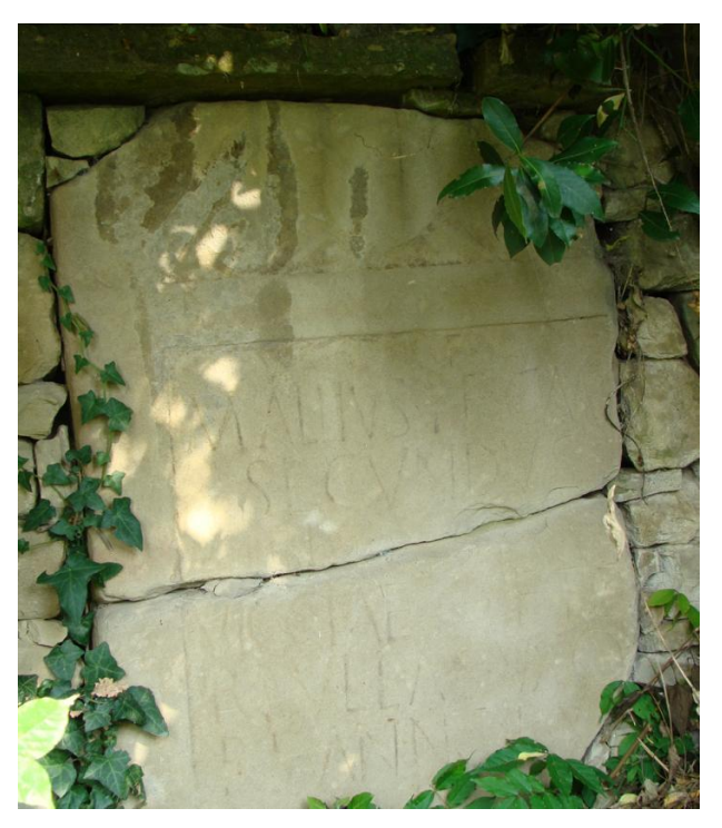
Figure 17: Roman Grave Stone

A roman gravestone has been relocated into the wall of a house.