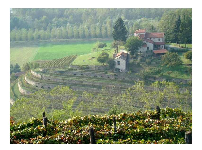
Figure 15: Monteoliveto from above

Lastly the 'Scau', chestnut drying hut, is a restored structure that has been put into action with a yearly drying (occurring over a period of 40 days). The building is also used as a community meeting place for regular meetings or story telling. All three points on the landscape are connected through trails.