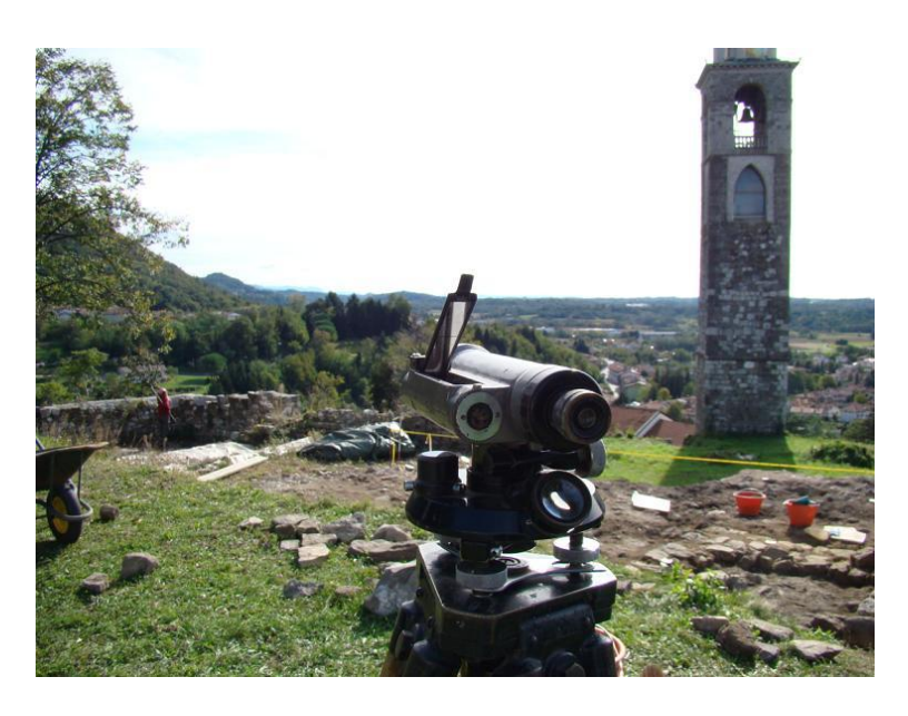
Figure 13: Artegna excavations (1 of 6 areas being explored)

The past research in the ecomuseum territory is quite abundant compared to other ecomuseum territories surveyed in this project. The Artegna excavations at San Martino have been underway for 6 years. The town of Artegna manages the site and funds the excavations one month per year. Currently Artegna is collaborating with Ecomuseo delle Acque to help to support community involvement in the research. This collaboration is mostly focused on schools but there are a number of future plans for building on this project listed below. Unfortunately materials from the site are sitting unstudied because of a lack of funds. Excavations have continued once a month in order to retain the permit and now to give students a hands-on opportunity for learning.